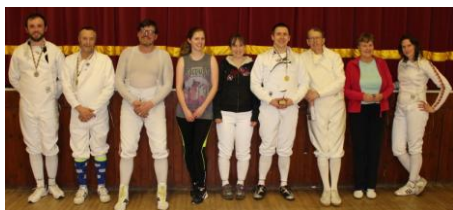
Club Members on the night...